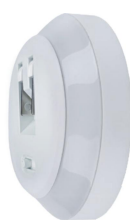
Screen Temp & RH Display