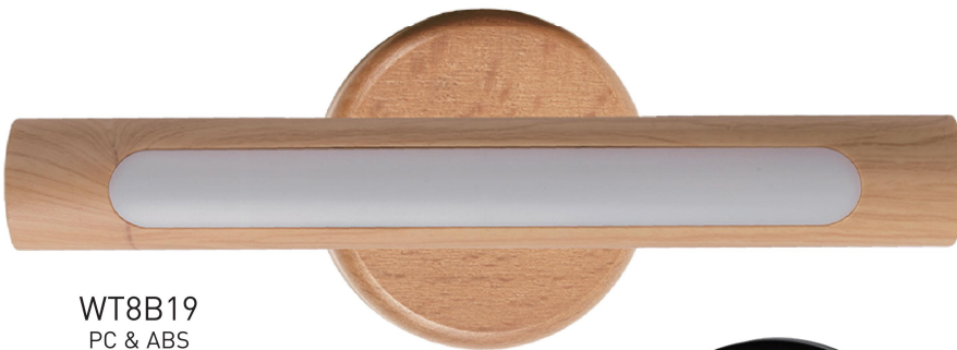
WT8B19 PC & ABS