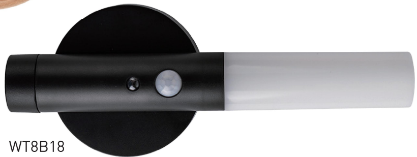
WT8B18 PC & ABS